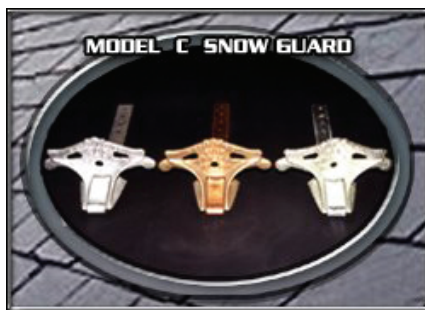
Model C: Available in Aluminum, Bronze & Galvanized Iron

Sieger Snow Guards, Inc. P.O. Box 320 Leesport, PA 19533-0320 Phone: 610-916-0815 Fax: 610-916-7582 info@siegersnowguards.com