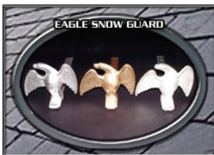
Eagle: Available in Aluminum, Bronze & Galvanized Iron