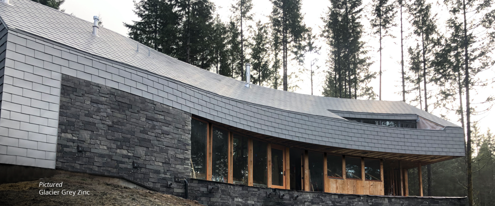
Pictured Glacier Grey Zinc